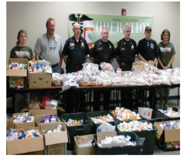
Drug Take-Back Event

To dispose of prescription and over-the-counter drugs, call your city or county government's household trash and recycling service and ask if a drug take-back program is available in your community. Some counties hold household hazardous waste collection days, where prescription and over-the-counter drugs are accepted at a central location for proper disposal.