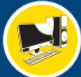
Computer 3 Stickers