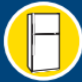
Refrigerator, Freezer, Dehumidifier, Air Conditioner 8 Stickers