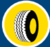
Tire 1 Sticker