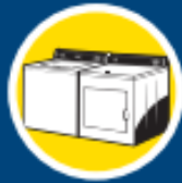
Washer 5 Stickers Dryer 4 Stickers