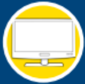
Television 36" or less - 3 Stickers 36"-50" - 4 Stickers 50" or larger - 5 stickers