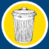
Extra Trash Can 1 Sticker

Stickers may be purchased at the Pennington Borough Hall and placed on items - each sticker covers around 40 lbs. After stickers are affixed on bulk items they're cleared to be picked up with regular trash on your scheduled day. See below for some examples.